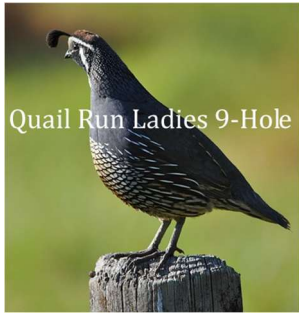
Quail Run Ladies 9-Hole